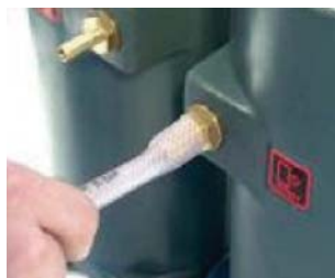
All threads are brass inserts and the hose pipe connectors are included.