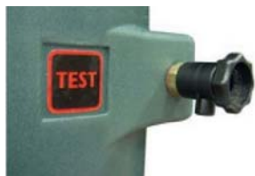
TEST feature TEST kit included