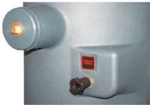
TEST feature TEST kit included