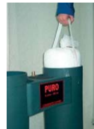
Helpful lifting handles on the elements