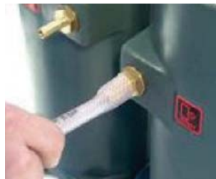
All threads are brass inserts and the hose pipe connectors are included.