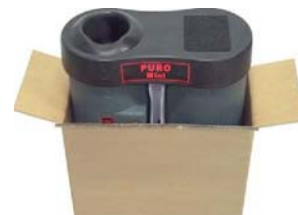
Compact design allows for cost effective shipping.