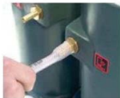
All threads are brass inserts and the hose pipe connectors are included.