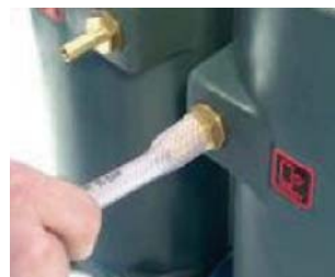
All threads are brass inserts and the hose pipe connectors are included.